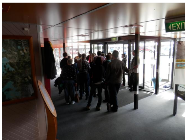
Hydro Power Station Tours were popular, taking people by bus from Lake Pedder Chalet to the Gordon Power Station.

Many tourists stayed over Saturday night and told us they were very pleased with the chalet meals and accommodation and the fact that it was now open again.